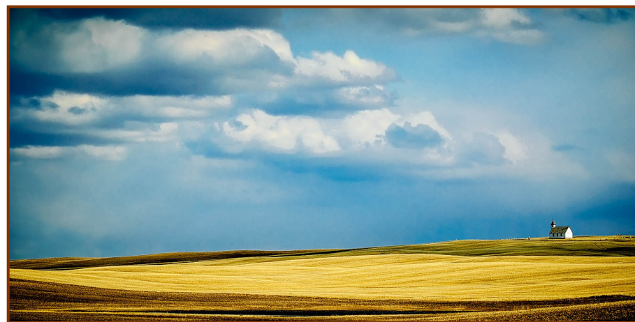
Little Church on the Prairie by Paule Hjertaas, Regina Photo Club Third, Spring Digital Competition 2019

prairie photographers sharing photographic experiences