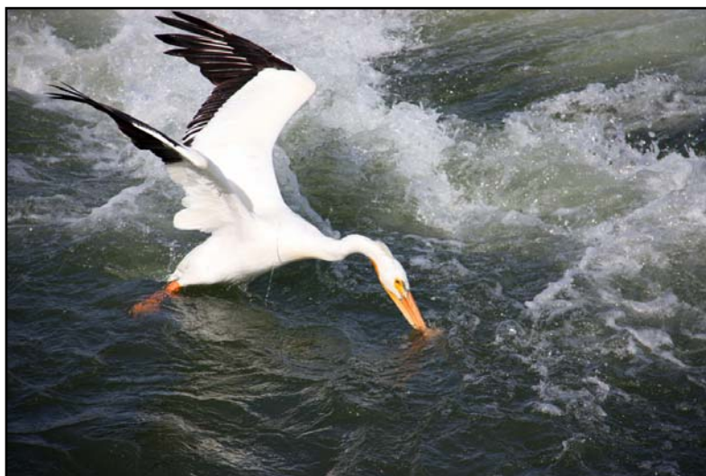
Trophy Winner – Saskatoon Camera Club