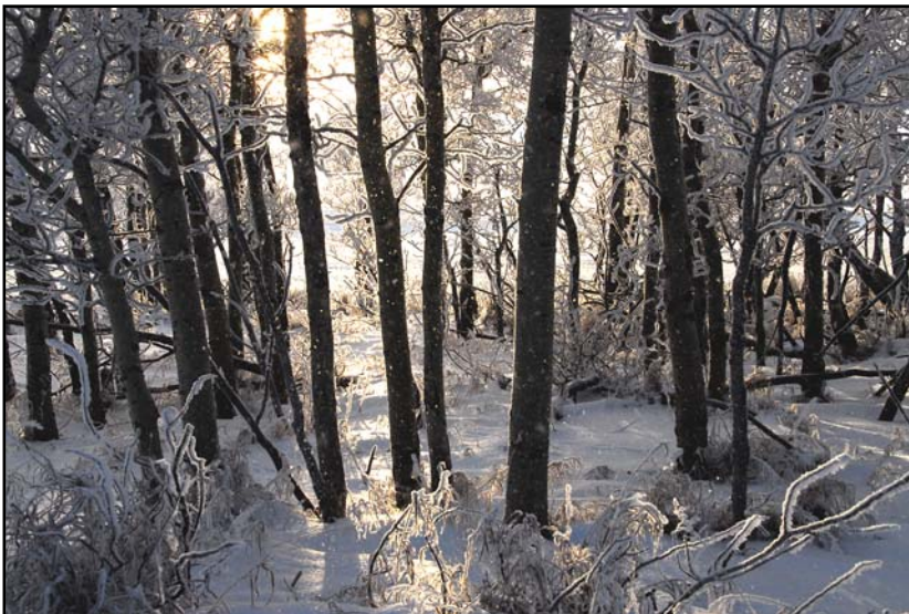
3rd First Light – Rella Lavoie