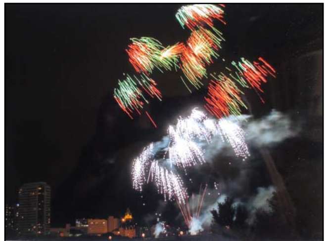
Bursts of Color — Len Suchan