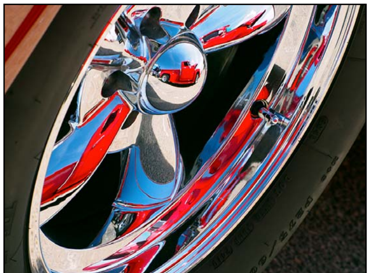
HM Classic Wheel Reflections – Curtiss Lund