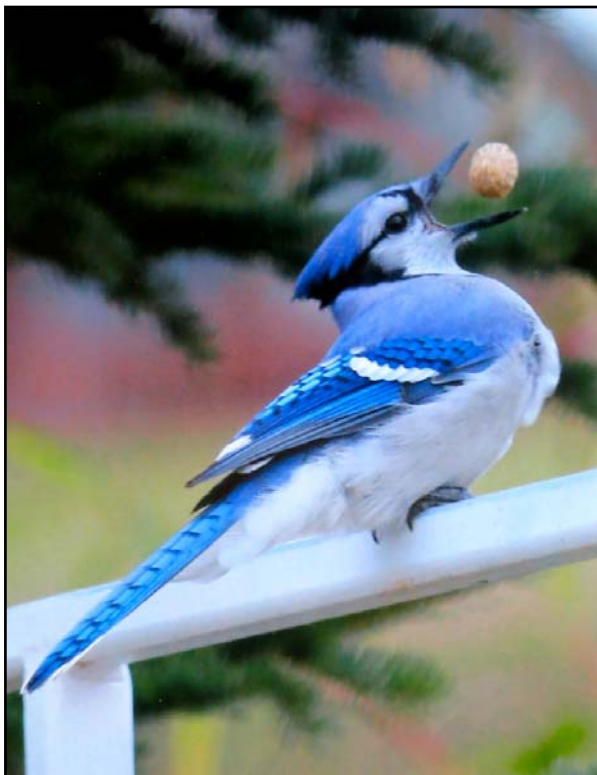
Look Ma, No Hands!