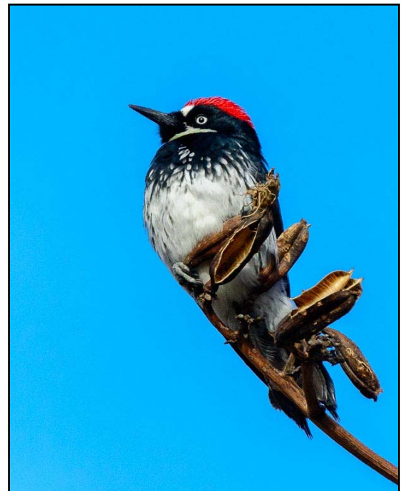
2nd Sitting Pretty – Paule Hjertaas