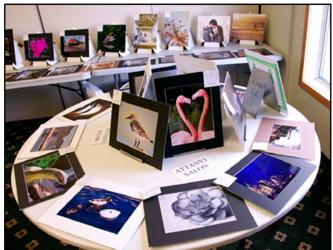
Attanyi Salon print display (above) Portrait Print display (previous page) Candle Lake Outing, June 2015