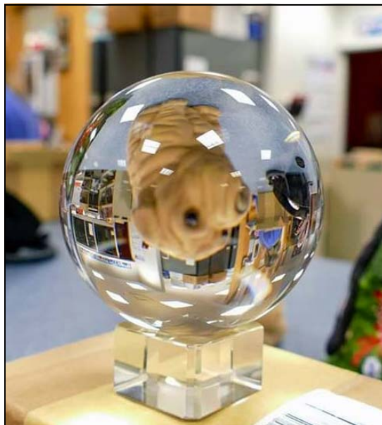
one of the glass orbs

Another item we bought for our club was several glass orbs for members to sign out. They are something fun to play around with while out shooting.