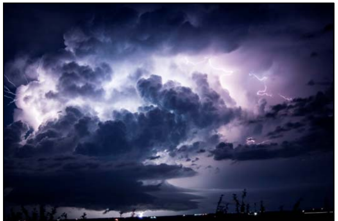
HM - Pleasant Sunset / Unpleasant Light Show Mary Ann Janzen, RoPC