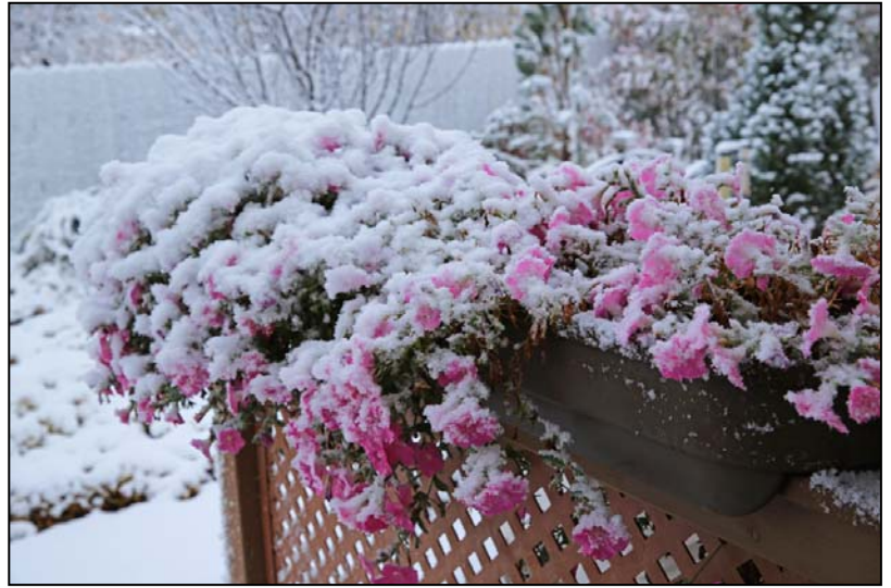
1 Glowing Marigolds / Smothered in Snow , Jim Turner, RoPC