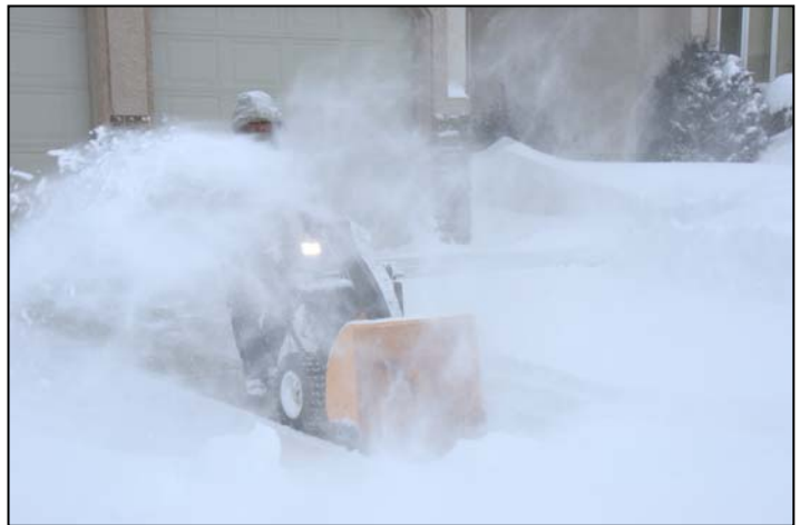
HM - Pleasant / Unpleasant Jake Zondag, CAPS