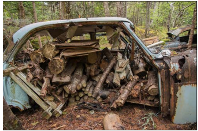
2 - Really Sweet Ride / Really Rough Rusty Morris, RoPC