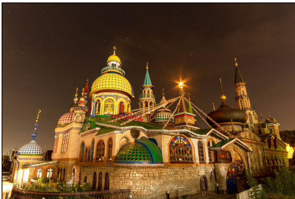
Kazan, Russia August 2019

As always, check the PRPA website for news and changes to competitions rules. There are newly created fillable forms to download from the website. Also, if PRPA members have interesting activities in mind throughout the year, please share them on the PRPA Facebook page.