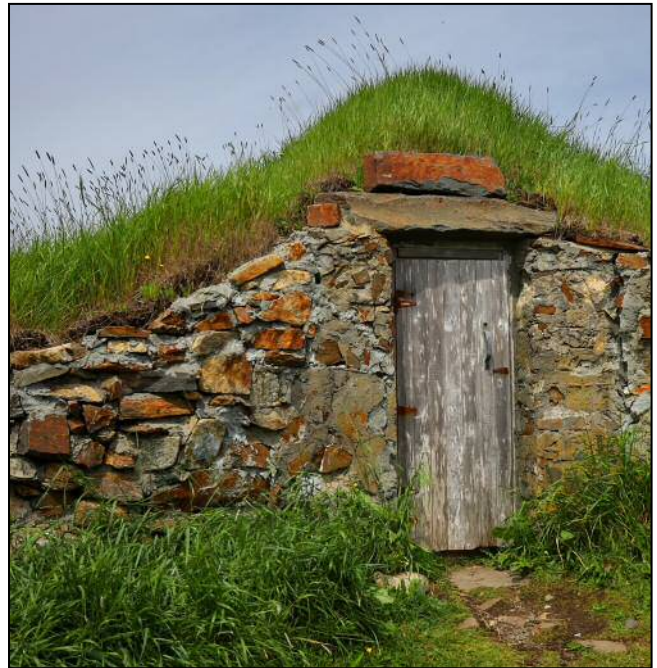
HM Little Howler / Hobbit House – Theresa Busse, RePC