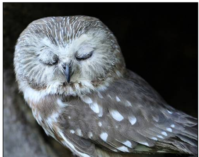
2. Open Eye / Shut Eye – Colleen Edwards, IWPA