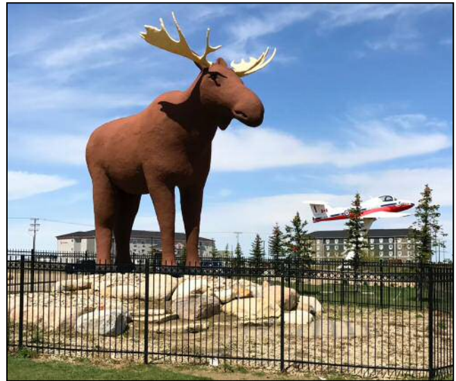
“Mac” the Moose at the Moose Jaw Visitor’s Centre

See my contact information on the back page.