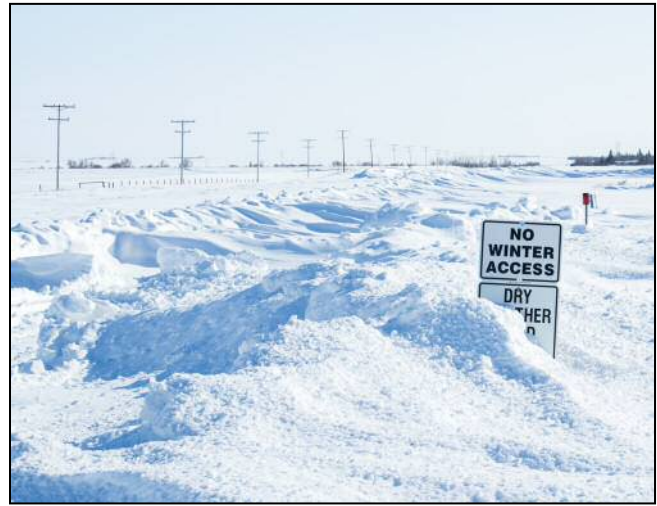
1. The Open Road / Closed for the Winter – Rusty Morris, RoPC