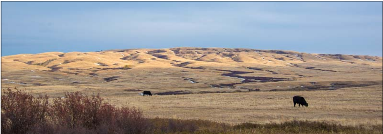
A typical prairie scene near Maple Creek