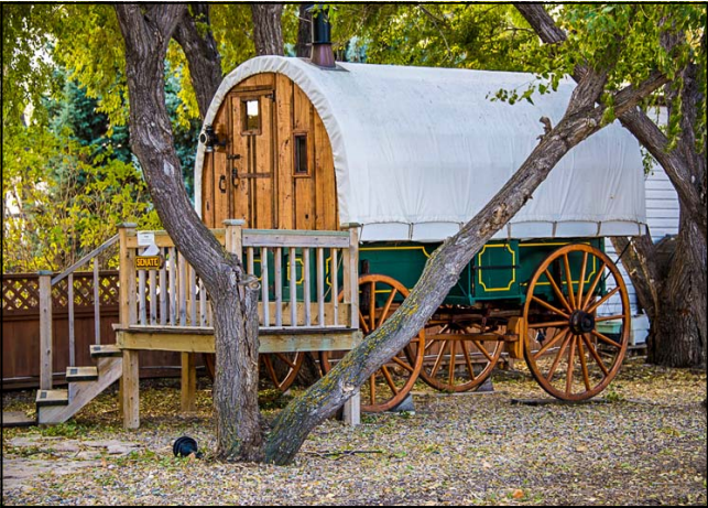
The Vidora Sheep Wagon at Ghostown Blues