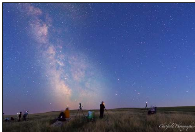
Shooting the Milky Way taken at the 2016 Dark Sky Weekend

Hope to see most of you at Maple Creek in a few weeks!