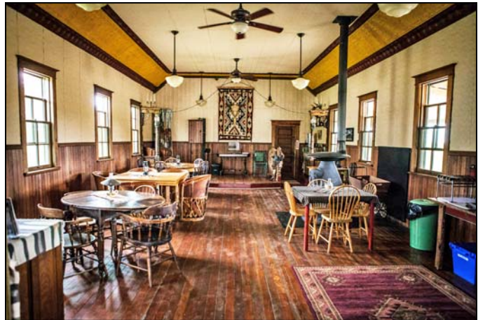
Dining Lodge in a former church

Here are a few more photos of the Ghosttown Blues facilities.