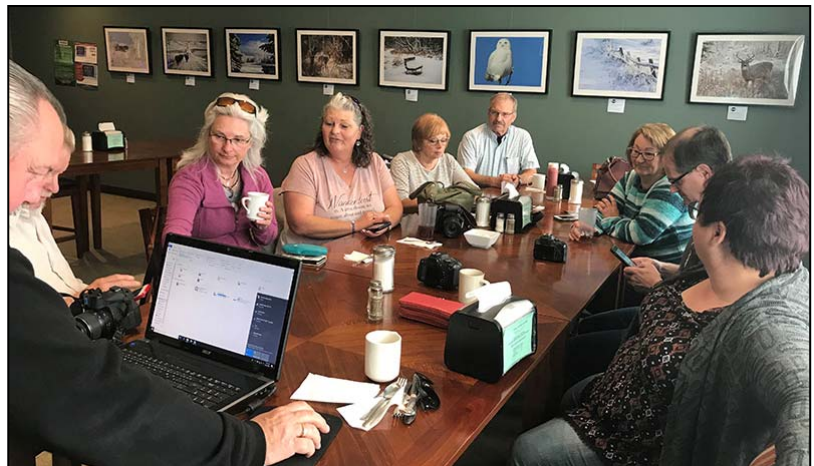
Nalanda Miksang Moose Jaw meeting at Carol's Café and Catering, May 12, 2018