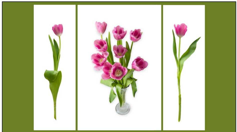
2 (tied) Dancing in the Limelight Amy Wildeman, SCC