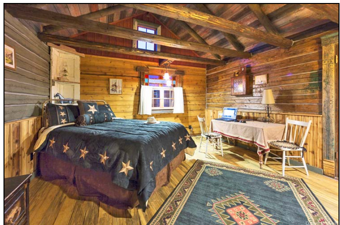
Walsh Cabin interior