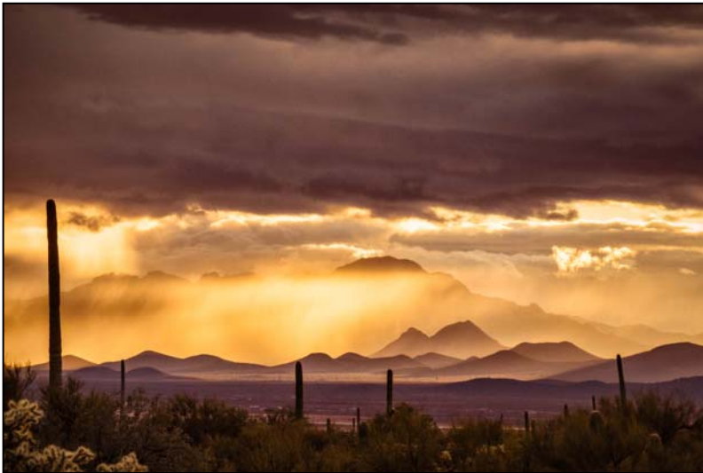
1. Pelican at Early Morning by Don Mathieson, RePC Front Cover