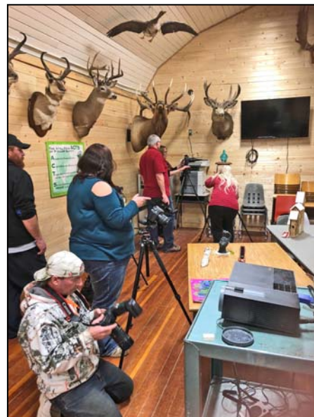
Group Activity at Wildlife Hall

It has been a honor to be the GOT PRPA rep and best wishes to who ever takes it on.