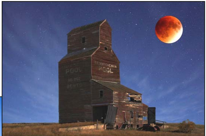
1. Super Bents Moon by Rusty Morris, RoPC