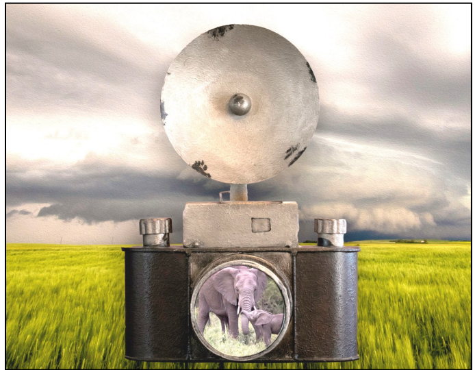
2. Prairie Elephant Photo Shoot – Tracy Miller, IWPA