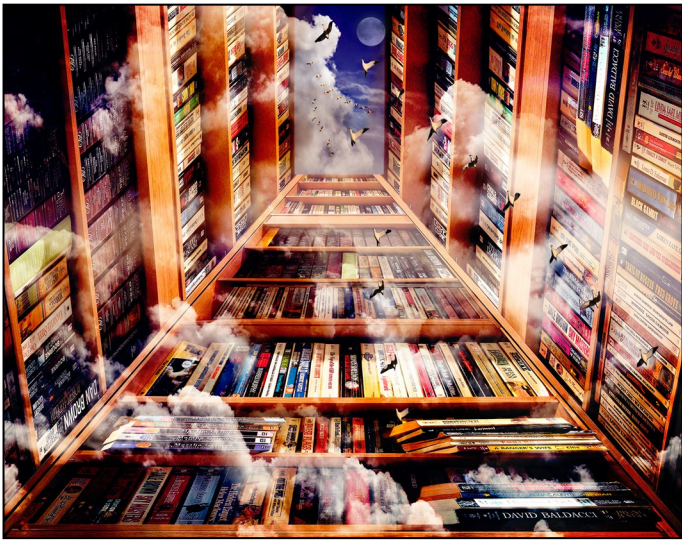
1. Never Ending Adventure – Colleen Edwards, IWPA