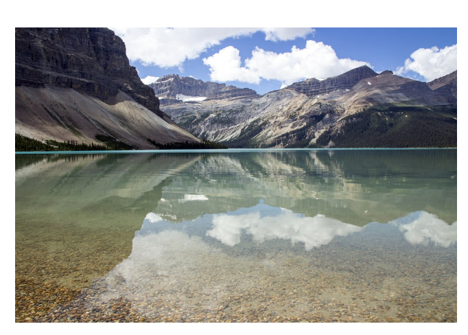
HM Thin Blue Line, Rusty Morris, RoPC