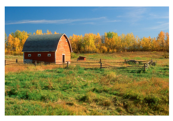
HM Little Red Barn, Larry Easton, IND