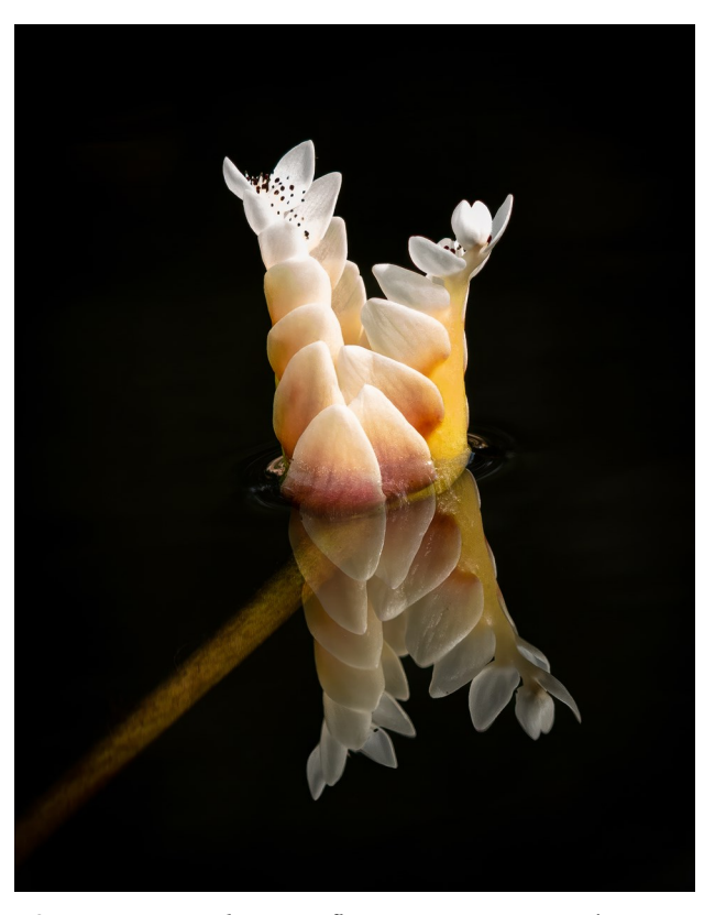
2. Water Hawthorn Reflection, Rae McLeod, SCC