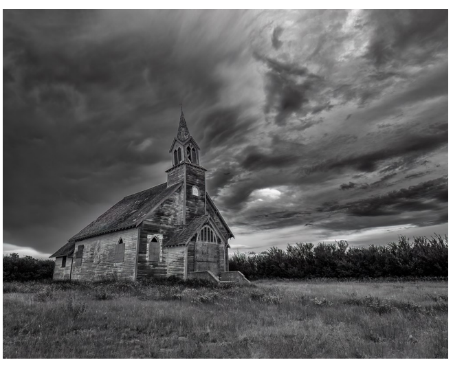
HM Passing Storm, Ed Fonger, IWPA